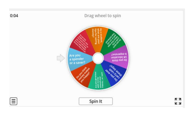
Figure 2 – Random Wheel «Money» on the onlineplatform WorldWall

On the topic «Money», the «Random Wheel» template (Fig. 2) was chosen for warming up. The teacher appoints the respondent and turns the wheel on which he stops, the student answers exact question. This exercise solves the issue of motivation for speaking, allows student to build grammatically correct sentences, develops communication skills and think creatively.