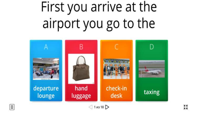
Figure 1 – Quiz «Airport» on the online-platform WorldWall

To confirm the opinion that warm-up activities increase the motivation for online classes, during two months (March-April) 2021, a series of English classes was conducted using an online platform, namely WorldWall . For example, on the Airport theme, a picture quiz was used (Fig. 1), which helps to consolidate the passed material. With the Google Meet distance learning platform, the instructor is required to enable Screen Sharing and manage the progress of the quiz.