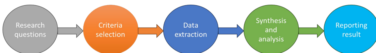
Figure 1. Research methodology for the present systematic literature review

The methodological framework was based on an iterative process of gathering and analyzing literature. The comprehensive search included databases such as Google Scholar, Web of Science, and academic journals, focusing on articles published between 2019 and 2023. The inclusion criteria were publications that discussed digital transformation within the context of business process management, with a particular focus on sustainability and corporate governance. To do this, we used the following methodology for the study of this systematic literature review Figure 1.