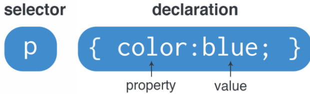
Figure 2.1. - CSS style description syntax

Style sheets are built according to a certain order (syntax), otherwise they cannot work properly. Style sheets consist of certain elements (Fig. 2.1):