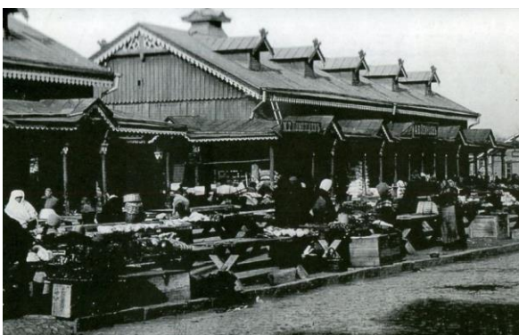
Fig. 4 – Blagoveshchensky Market in 1901 (top) and after restoration in 1916

This market was characterized by unsanitary conditions, especially in the meat and fish sections, which spread viruses during the hot summer months. The Kharkiv City Duma, led by O. Pohorelko, decided to build a new covered market. The scholar planned to build this market based on the model of German municipal markets, with refrigeration chambers, electric lighting, and specialized quality control services [22; 23].