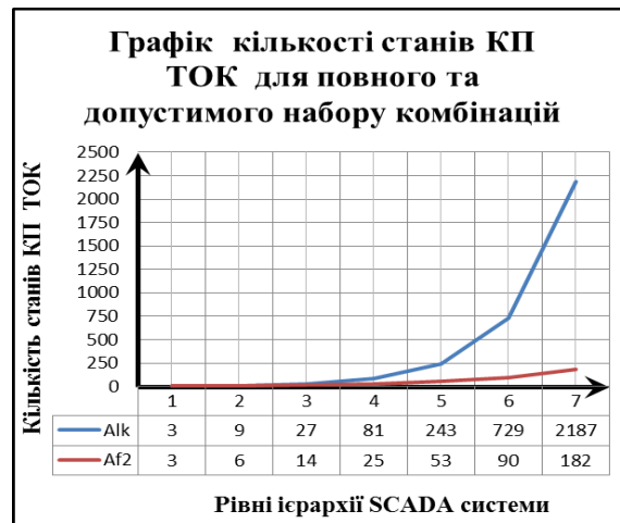
Figure 2.2 - Graphs of the dynamics of changes in the number of states of the TOC control system