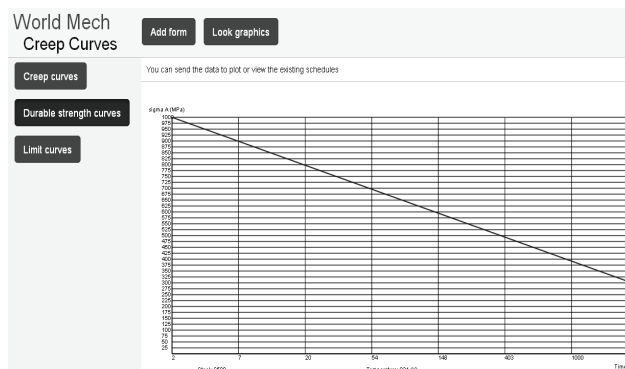
Figure 4 – Presentation of long term strength law

The third form uses for input of experimental results which represent the data set characterizing the fracture of specimen. Coordinates here are mean and amplitude stresses which combination brings to fracture at the same time. The user has to be filled these data in an array with two columns.