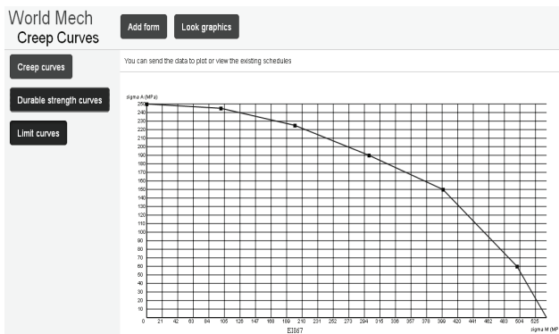
Figure 5 – Presentation of diagrams of limiting amplitudes and stresses

Both forms demand temperature value, steel or alloy grade and reference to the publication in a literature.