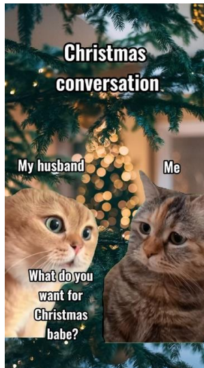
Picture 1. The viral Instagram cat meme

One of the recent examples of pebbling is in Picture 1. It represents the combination of two most viral Instagram cats at the end of 2023 and the beginning of 2024 as well as couple gift giving as one of the most popular topics for Christmas memes.